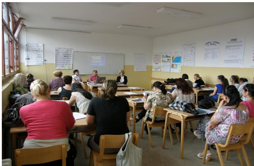
Gathering “Domestic Violence – Appearing Forms and Recognition” in Novi Grad, June 2011