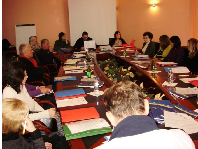
Workshop with Council for social policy and social protection of Banja Luka City Assembly, 1 February 2011 in Banjaluka