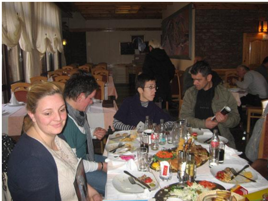
First working meeting regarding the forming Women's Alternative Government, Banjaluka, 27 December 2011