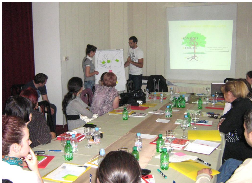
Workshop “Planning and Budgeting of Mini Projects” in Sarajevo 24 and 25 May 2011