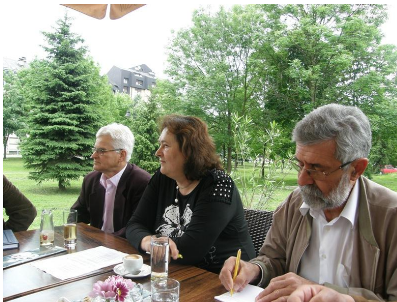
Final conference and presentation of project's results in Banjaluka, 13 May 2011