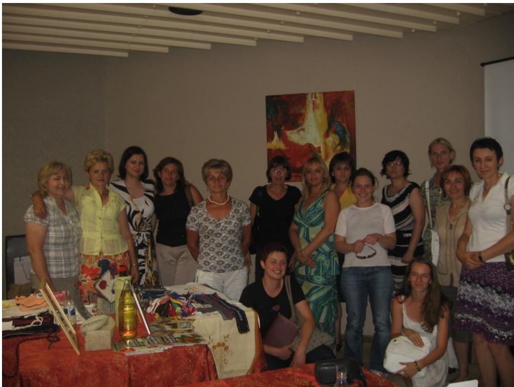
Final conference, June 2011