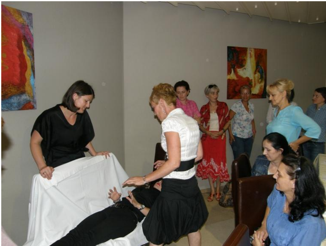
Workshop in Banjaluka “How to Easier Get a Job”, 23 July 2011