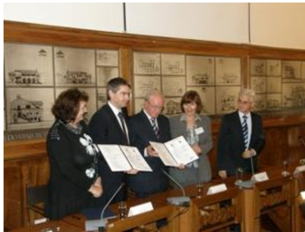
Pula, 28 March 2011

people from these cities, which established co-operation for the realization of cross-border projects and activities that involve improving of national minorities' status, strengthening of intercultural dialogue, and spreading the spirit of multiculturalism.