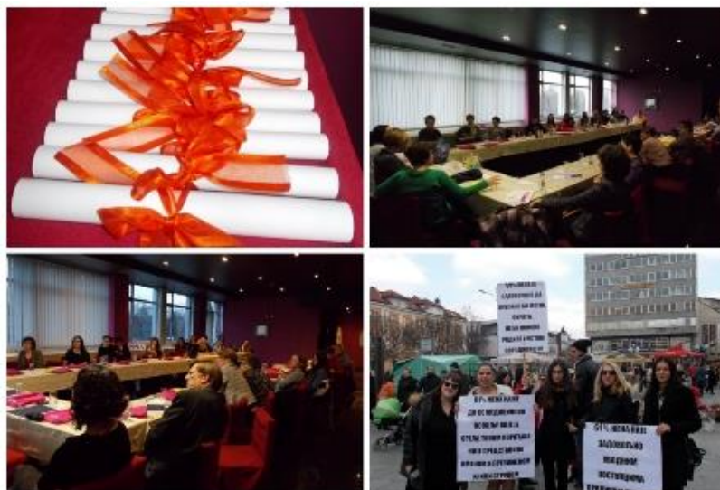
Final conference, 6-8.3.2015, Laktaši