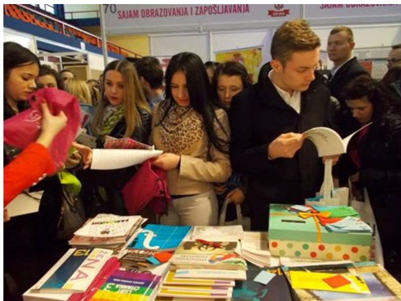
hCa BL stand on Fair of employment and education, march 2015