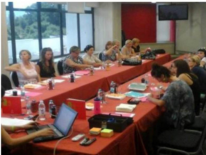
Final meeting "Monitoring the implementation of the UN Convention on the Elimination of All Forms of Discrimination against Women", June, Teslić

hCa begin realizing Women's side of politics II in October 2013 as continuation of project that started in 2011. Goal was to empower position of women from political parties, especially within management structures and CSOs so that women can equally participate in decision making processes through education within Women political academy II and by supporting activities of