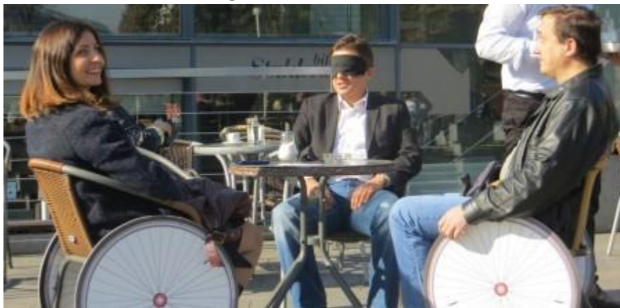
Coffee without prejudices, October and November 2015.