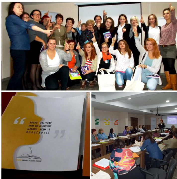
Basic training for Initiative members, 7-9.10.2015, Banja Luka