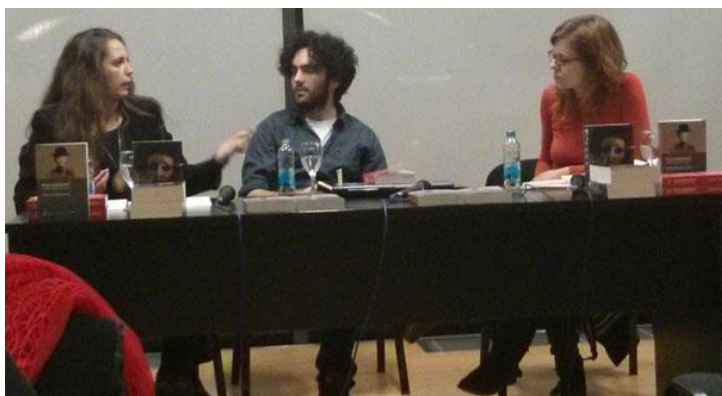
Promotion of the book "Who is an individual, genealogical questioning of citizenship", 19.2.2015, Banja Luka