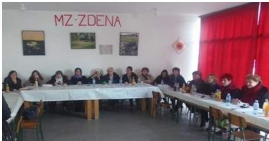
Workshop on "Sexual and reproductive health of women," February 13, 2015, MZ Zdena, Sanski Most