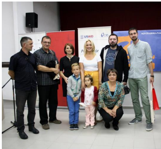
Award ceremony "Srđan Aleksić" 2015, Doboj