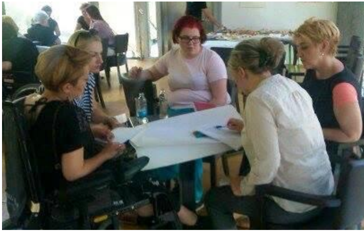
Training "Monitoring the implementation of the UN Convention on the Elimination of All Forms of Discrimination against Women", Banja Luka, 6 June 2015.