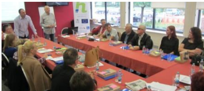
Training "Public advocacy for improvement realization of the right of persons with disabilities in BiH" 8 th and 9 th of October 2015, Teslić