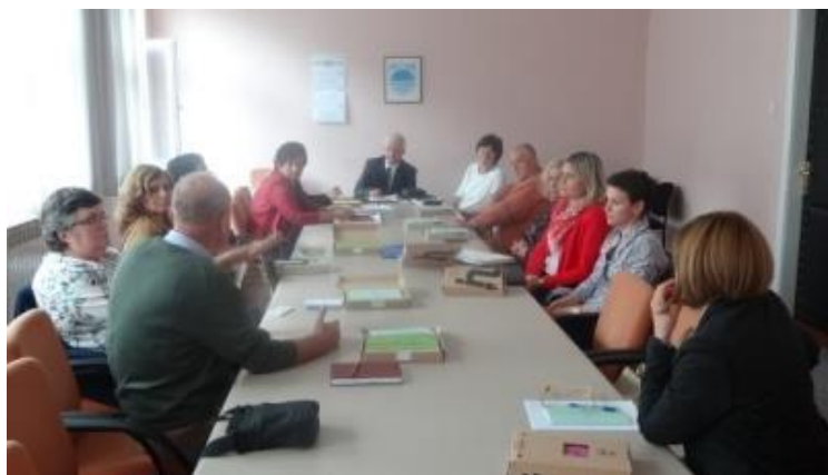
Meeting with representatives of Herzegovina-Neretva Canton, 8 th of October 2015