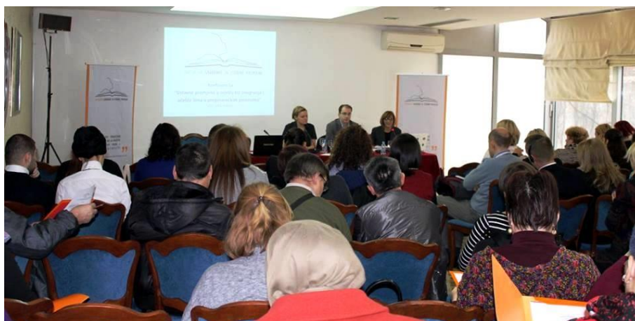
Conference "Constitutional reforms in the light of EU integration and participation of women in the negotiation processes", 22.12.2015, Sarajevo