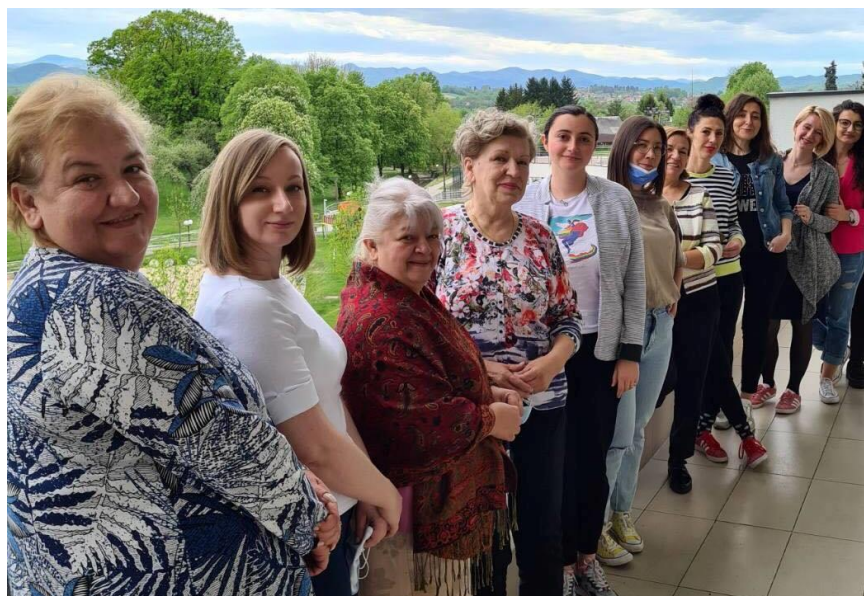
Workshop for creating Communication Strategy with the Action Plan 2021-2022 May 5-7, 2021, Teslić