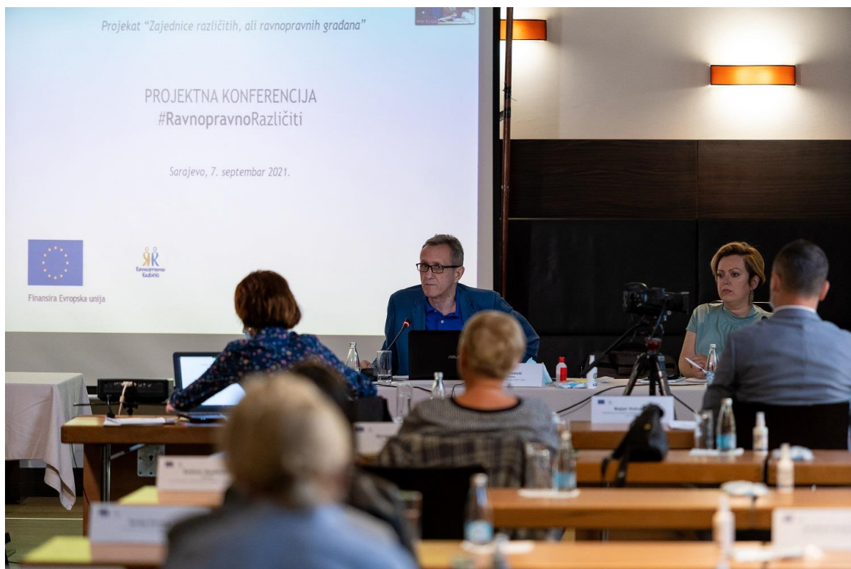
Closing Conference "Equally Different", Sarajevo, September 7, 2021

At the end of October 2021, the three-year project "Communities of Different but Equal Citizens" was completed. The project was jointly implemented by the Organization of Amputees "UDAS", as the project holder, and the Helsinki Citizens' Assembly Banja Luka and the Association of Citizens "Something More" as partners. The aim of the project was to achieve a higher level of involvement of civil society organizations in European Integration and decision-making processes in BiH, with a focus on fundamental rights, social inclusion and combating discrimination against persons with disabilities.