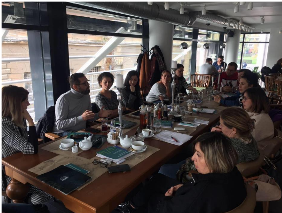
Breakfast with Journalists, October 27, 2021, Banja Luka

Also, we organized a "Breakfast with Journalists" with the aim of establishing new and maintaining existing good relations with media houses and journalists, and to jointly problematize or update certain topics. The topic of this Breakfast was a discussion on tools for preventing gender-based violence against women and for promoting gender equality. Specifically, we talked about the Pillar of Shame, the Guidelines for the Prevention of Sexual and Gender-Based Harassment, and the Guide for Engendering Civil Society Organizations. By exchanging experiences and talking to 10 journalists about media policies and practices, we came to the conclusion that the use of gender-sensitive language is extremely important for women's visibility and promotion of gender equality in society, and that all attendees should adopt and apply the engendering practices outlined in the Guide to the extent feasible.