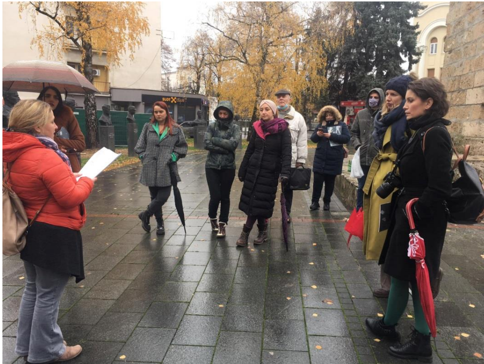
Feminist Tour through Banja Luka, November 29, 2021, Banja Luka

In order to introduce our fellow citizens to the famous women of Banja Luka, what they did and what are their merits, which is rarely or never talked about, we organized a Feminist Tour through Banja Luka and presented the Lexicon "100 Women - 100 Streets after Women" which includes stories about women who have pushed boundaries in their local communities. This lexicon can be an excellent basis for creating feminist tours in other cities in BiH.