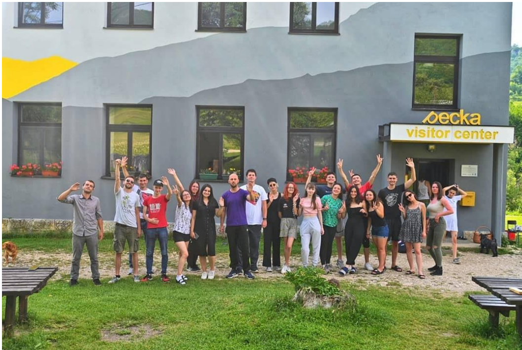
Camp participants, Pecka, June 2021

The "Ultimate Survival Leadership Camp" project was financially supported by the US Embassy in BiH.