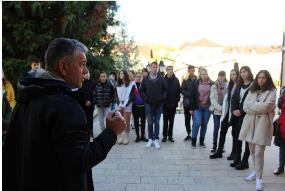
Living Library, Višegrad, October 25, 2021

"A very useful event, an activity that extends our horizons and creates space for understanding, spreading peace and avoiding prejudice. I am very proud of all the people who were here today, and to those who weren't, who are carrying various pains and yet willing to share them with others and live with them. I am glad that these people decided to come and share their life stories with us, and I think we can all learn one important lesson and that is that we are all human and that we all need to help each other, and primarily see each other as human beings, and not being seen only by our religion and nationality", this is the observation of one participant of the Living Library.