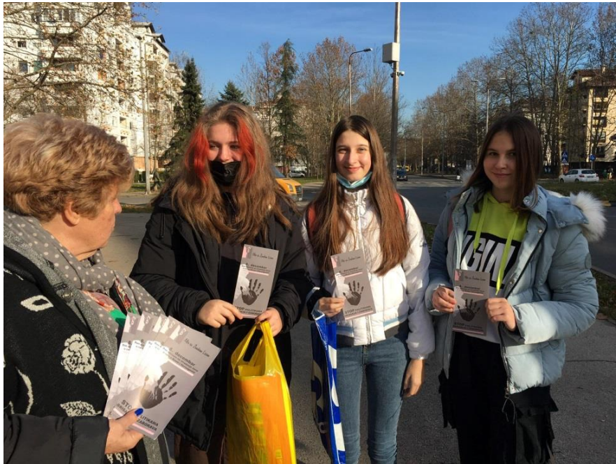
Street action, December 8, 2021, Banja Luka

organizations used the street action and distribution of flyers to point out the importance of establishing the Day of Remembrance of Women Victims of the War, as well as the number and fate of women who died in the war, which was unknown to the most of the people. We received encouraging reactions and support from the majority we spoke to.