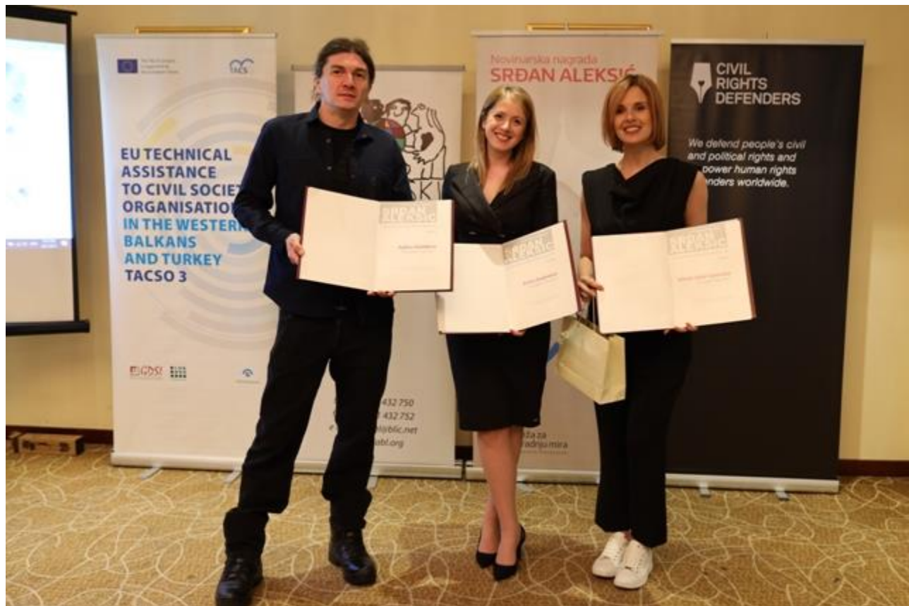
Announcing Journalist Award Srđan Aleksić, Banjaluka may 21, 2021

The Journalist Award "Srđan Aleksić" was established in 2010 by the Helsinki Citizens' Assembly Banja Luka, the Foundation Cure from Sarajevo and the Association of Young Journalists of Republic of Srpska, and in 2013 the award became part of the Network for Building Peace of BiH.