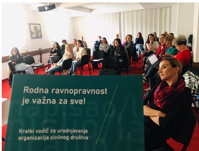
Workshop "Why is Gender Equality Important for All of Us?", October 6, 2021, Banja Luka

As a basis for the whole project, we created and published the publication "Gender Equality is Important for All of Us - A Short Guide for Engendering Civil Society Organizations". The guide provides answers to questions: how to include a gender component in projects, how to analyze whether and how project activities affect women and men, why it is important for CSOs to include gender principles in their structures and documents, etc. This publication was a tool for the preparation of two workshops (basic and advanced workshop) on strategies, methods and importance of including gender component in all aspects of CSO's activities and work.