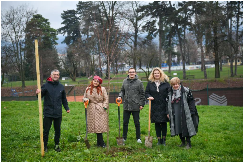
Planting the trees in Mladen Stojanović Park, Banjaluka, December 6, 2021

Thus, we supported the organization of another cultural-activist event at "Građa", an improvised and the only playground in Banja Luka's block Centar 1, where the tenants are still fighting for this playground not to be turned into a parking lot and get the look they were promised. In mid-August, a Graffiti Jam party was arranged at "Građa", within which various workshops for children were organized and the walls of the playground were painted.