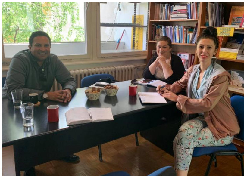
US Embassy in BiH visits the Helsinki Citizens' Assembly BL

The specific objectives of the consultation by HCA BL were: to form a group of women for advocacy activities and meetings within the WAB initiative, participate in two meetings with the EU Delegation in Sarajevo, organize five advocacy meetings with embassies in BiH, and bring the GAP III document closer to other organizations and relevant institutions. The embassies that participated in the meetings are: the Austrian Embassy, the French Embassy, the Embassy of the Slovak Republic and the US Embassy. The meetings significantly contributed to the exchange of experiences and information, with a focus on obligations through the GAP III document and greater commitment and better attitude towards women's rights and women's organizations in BiH.