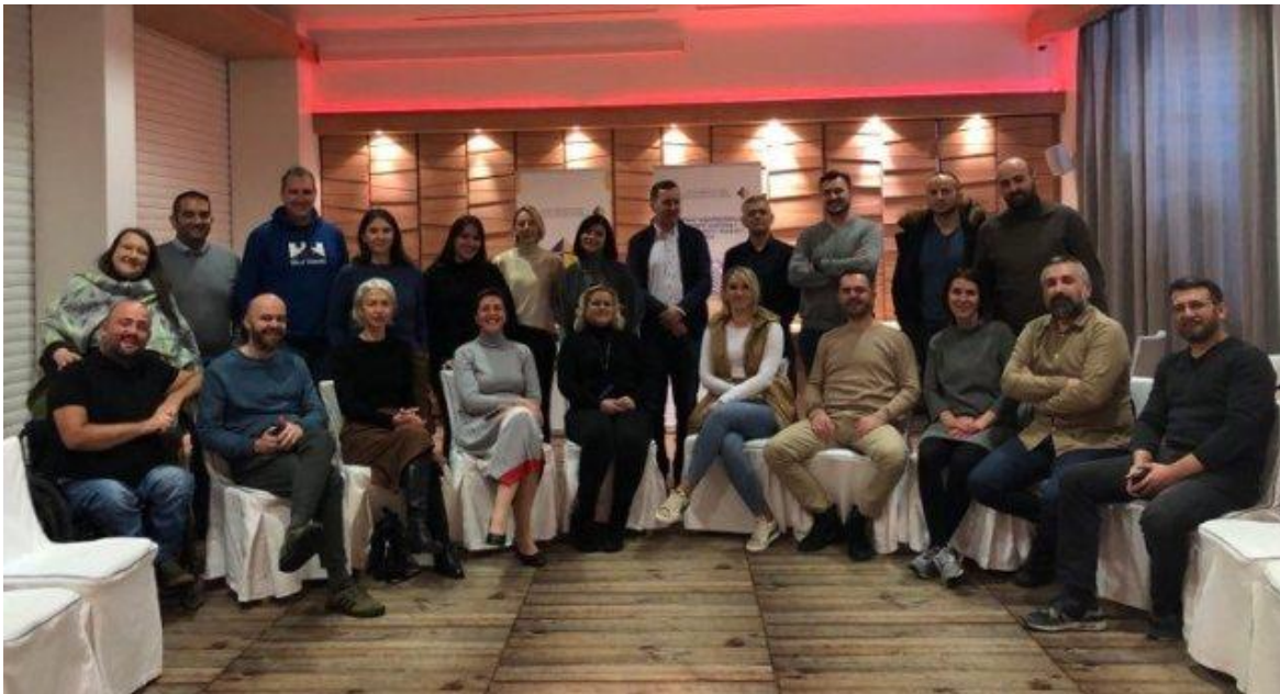
Living Library HJPC, Vlašić, December 2022

During the month of December, we organized a special Living Library for the High Judicial and Prosecutorial Council (HJPC), as one of the trainings for the staff of the Department for Improving the Efficiency and Quality of Work in the Courts. HJPC representatives had the opportunity to talk with a blind person who was a victim of domestic violence, a person with a disability, a member of the Roma national minority, a member of LGBTIQ+, a victim of sexual harassment and a victim of peer violence.