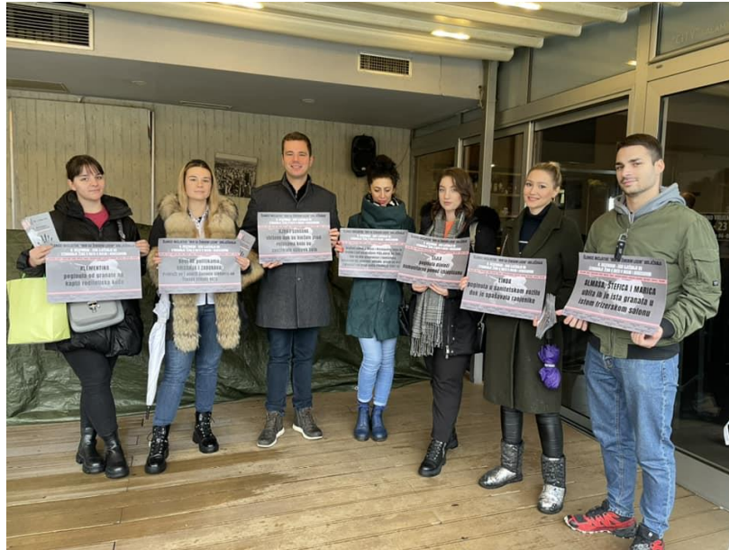
Commemoration of the Day of Remembrance of Women Killed in War, 12/08/2022, Banja Luka