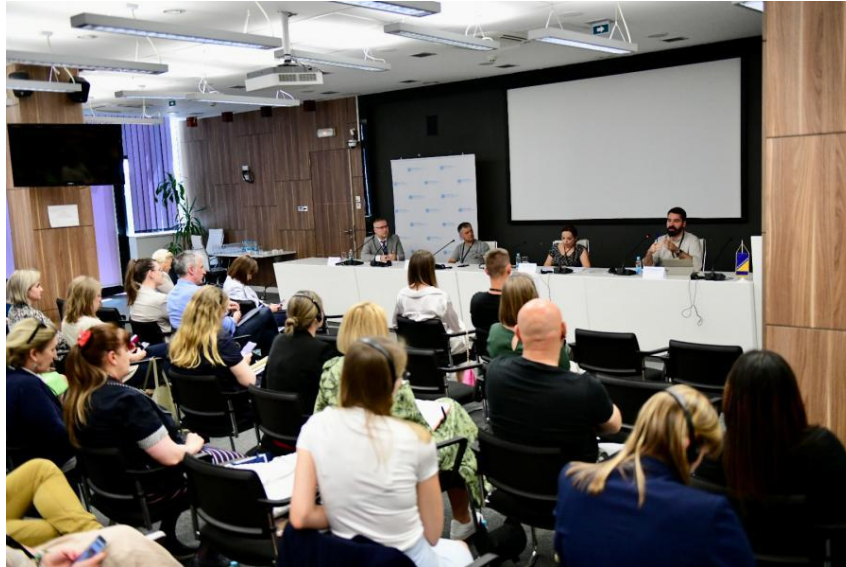
UN conference, Sarajevo – June 2022

At the session entitled Protection of Civil Society Actors , we discussed the current situation in the enjoyment of the right to freedom of expression, association and peaceful assembly throughout BiH.