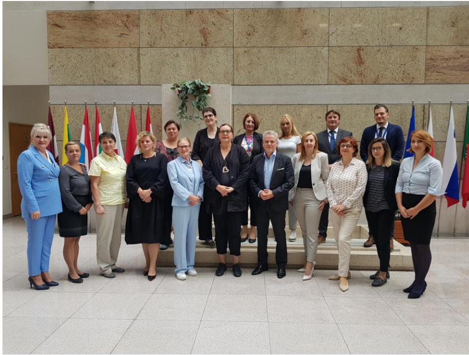
Meeting of the Women's Advocacy Group with Ambassador Sattler, September 5, 2022

A meeting was also held with the representative of the Agency for Gender Equality of BiH, Branislava Crnčević, and joint advocacy activities were agreed upon in connection with the harmonization of domestic legislation with the EU Directive on Work-Life Balance (2019/1158).