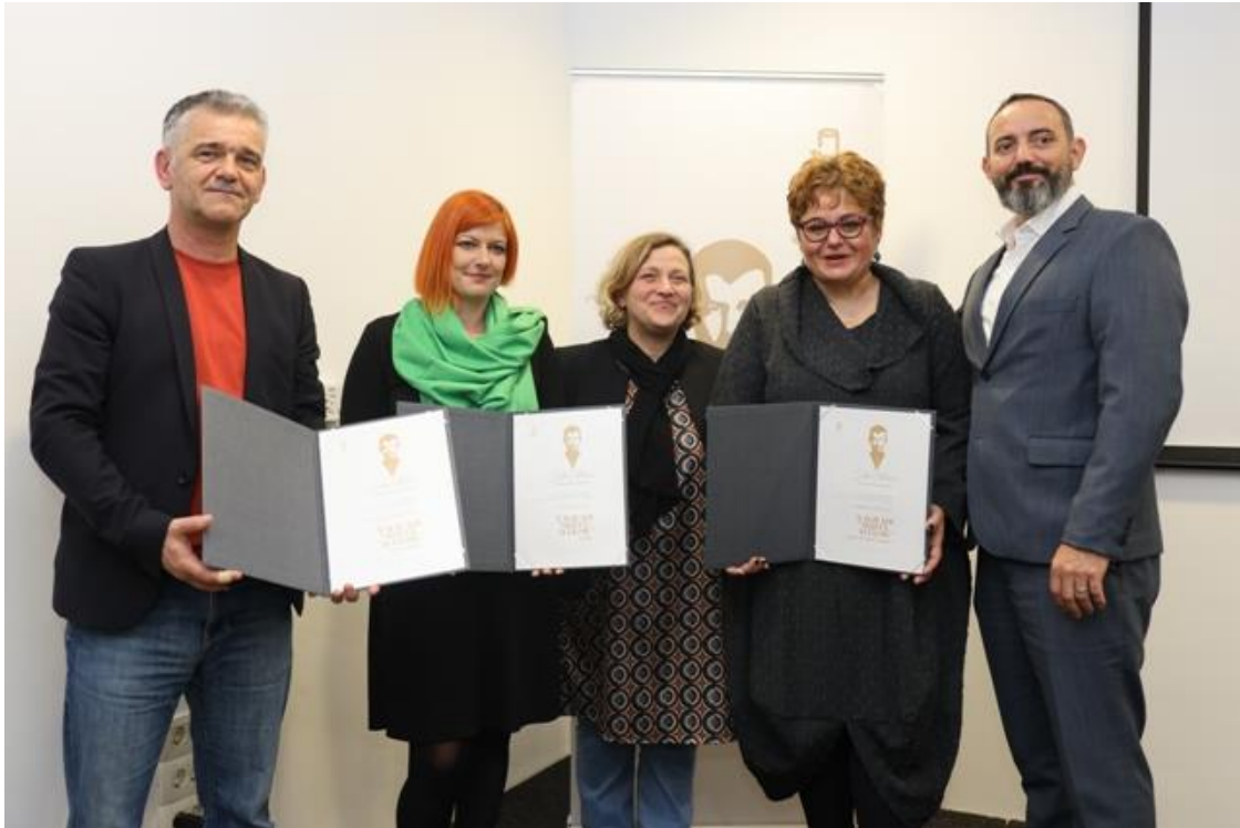
Formal award ceremony, Banja Luka, December 2022