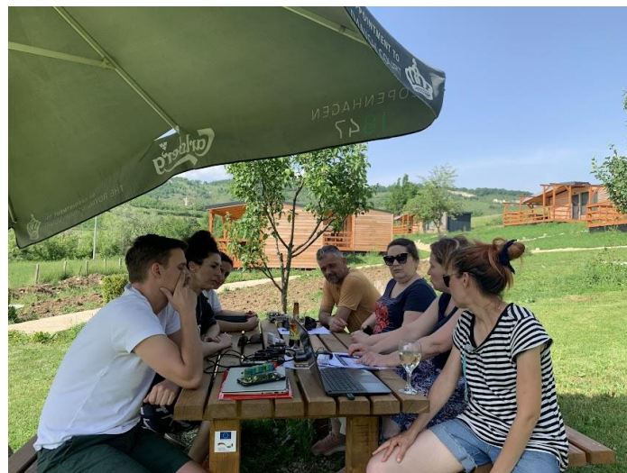
Teambuilding of the organization, June 3 and 4, 2022