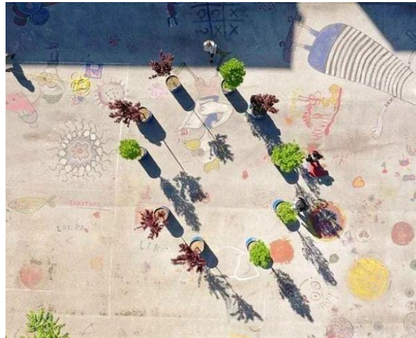
Atomic gathering, Banjaluka May 2022