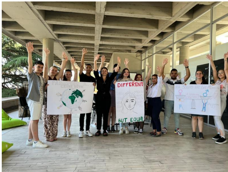
Workshop in Skopje, June 5, 2022

After Montenegro, on June 5, 2022, two workshops were held in Skopje, North Macedonia . The workshops brought together 25 children and young people from Skopje, and the project partner was the feminist organization Tiiit!inc. which deals with organizing conceptual events in the field of independent culture and art, as well as various events for the promotion and improvement of women's human rights. The host of the workshop was the Museum of Contemporary Art Skopje.