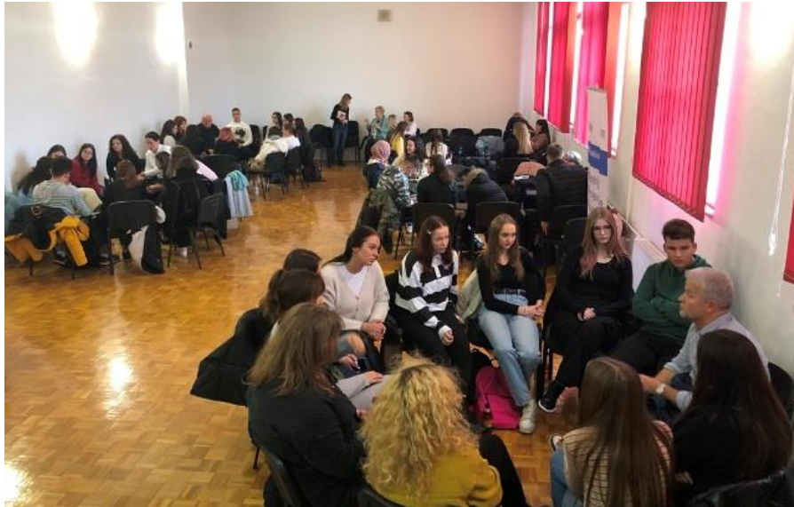
Living Library, Sarajevo, November 2022