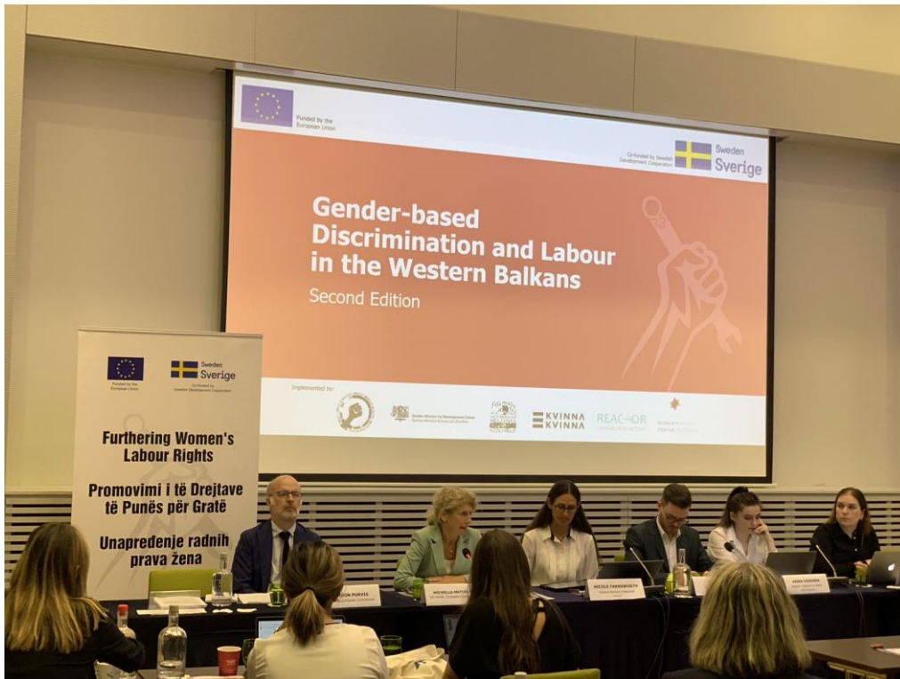
Presentation of the results of the regional report in Brussels, May 20, 2022

Balkans (WB). The research was conducted in six WB countries (Albania, Bosnia and Herzegovina, Montenegro, North Macedonia, Kosovo and Serbia).