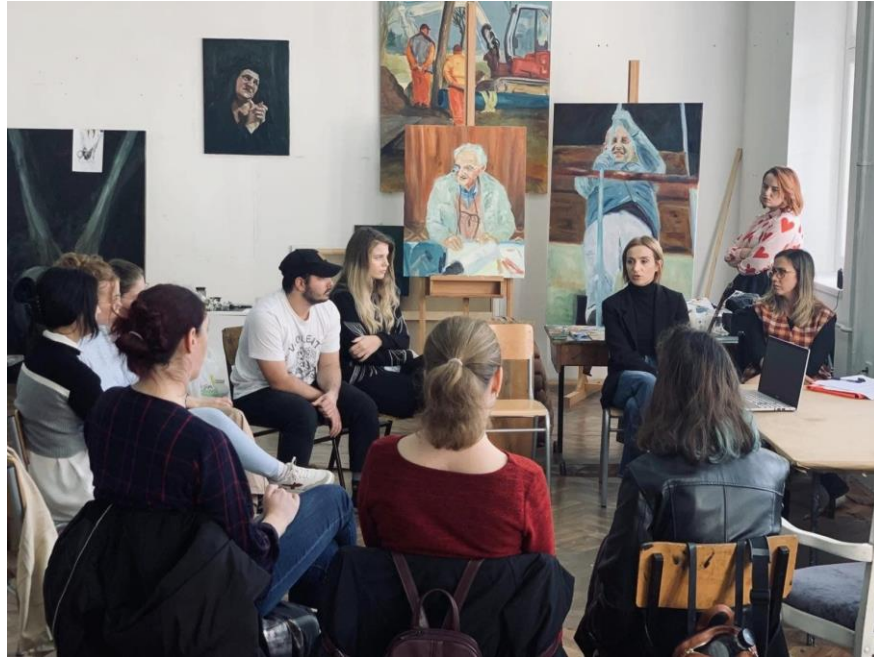
Talking about sexual and gender-based harassment with students Academy of Arts in Banja Luka

At the invitation of the Foundation United Women, the Helsinki Citizens' Assembly held several additional presentations on the Guidelines for the Prevention of Sexual and Gender-Based Harassment to students and staff of the University of Banja Luka on October 28 at the Faculty of Political Sciences of the University of Banja Luka; November 4 at the Faculty of Law; November 5 at the Faculty of Philosophy in Banja Luka and on November 15 at the Academy of Arts in Banja Luka.