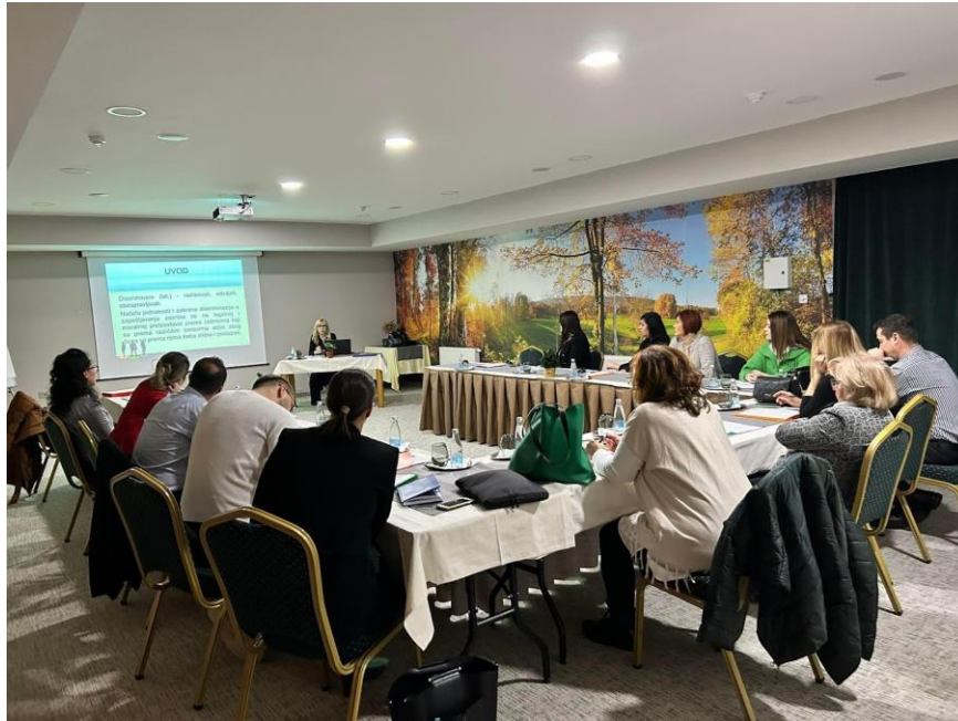
The first specialized training held on Trebević, Sarajevo, December 8-9, 2022

Also, as part of the 16 Days of Activism against Gender-Based Violence, the #redbision campaign was implemented to raise the awareness of the workers on GBD as well as getting acquainted with legal aid providers they can turn to; and meetings were held to network relevant actors and free legal aid providers.