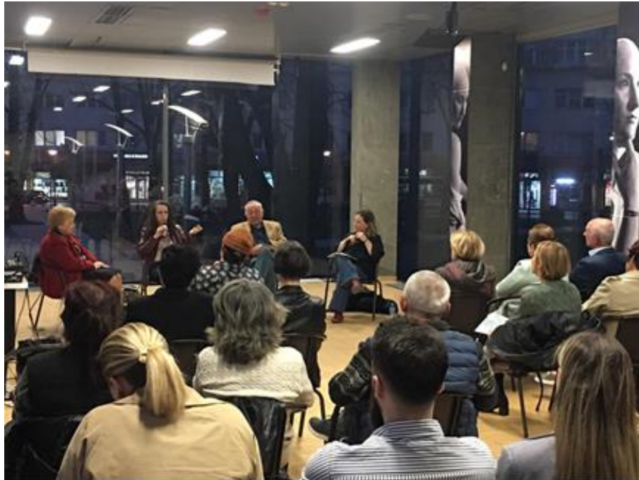
Panel discussion on famous women of Banja Luka, March 24, 2022

The feminist tour, which we organized on March 25, was attended by 8 women, mostly from the Department of Social Activities of the city, who expressed their gratitude for having the opportunity to participate in the tour and learn more about the famous women of Banja Luka.