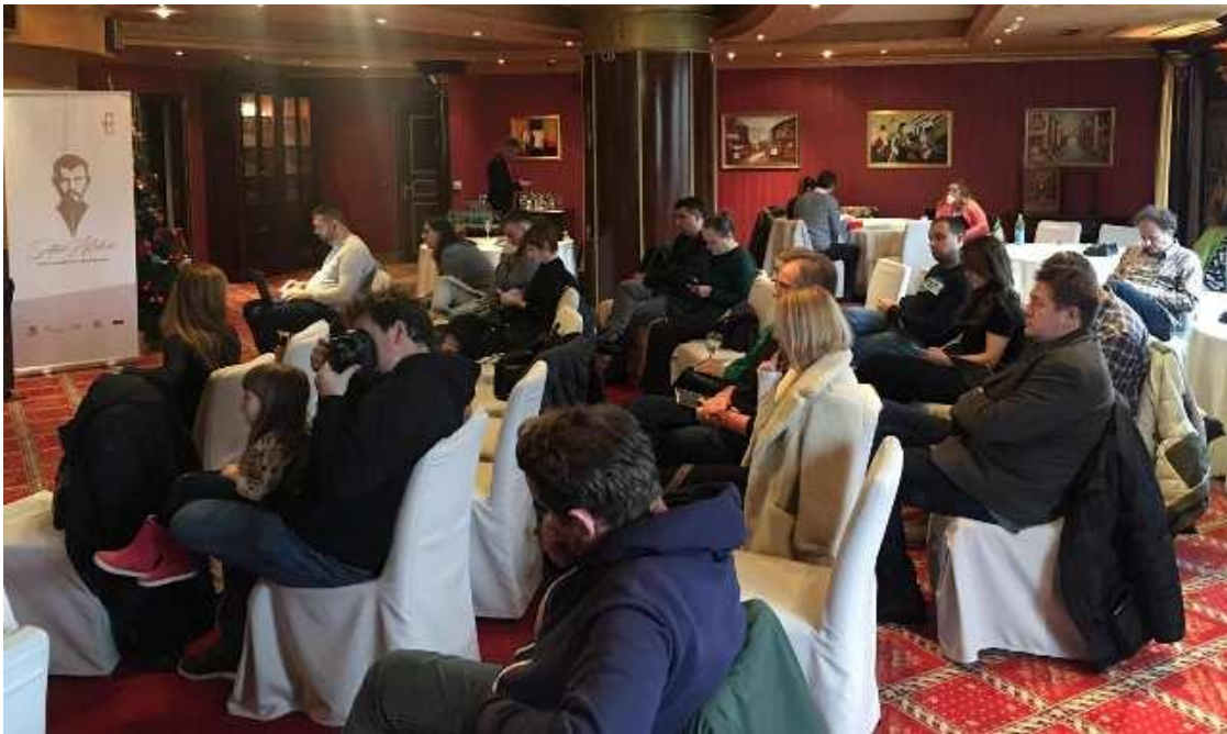
Regional conference, Banjaluka-December 2022

During the regional conference, we held four interesting panels, entitled: "Who Creates Our Attitudes and Values?" - The impact of new media and new information and communication technologies on information awareness, creation of attitudes and value systems", "How to Recognize a Lie? - Media literacy, fight against hate speech, fake news and fake portals" , "Sexist Speech in Public Space" and "Autonomy - freedom means responsibility" .