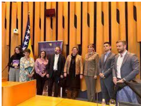
Celebrating Men's Day in the Parliamentary Assembly of BiH, November 18, 2022