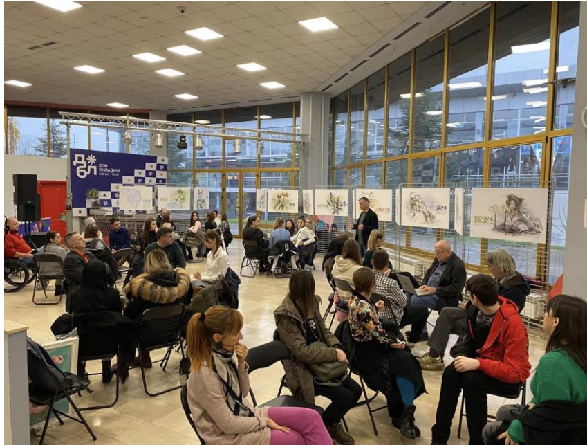
Living Library, Srđan Aleksić Days, Banjaluka, December 2022

During the regional conference, we held four interesting panels, entitled: "Who Creates Our Attitudes and Values?" - The impact of new media and new information and communication technologies on information awareness, creation of attitudes and value systems", "How to Recognize a Lie? - Media literacy, fight against hate speech, fake news and fake portals" , "Sexist Speech in Public Space" and "Autonomy - freedom means responsibility" .