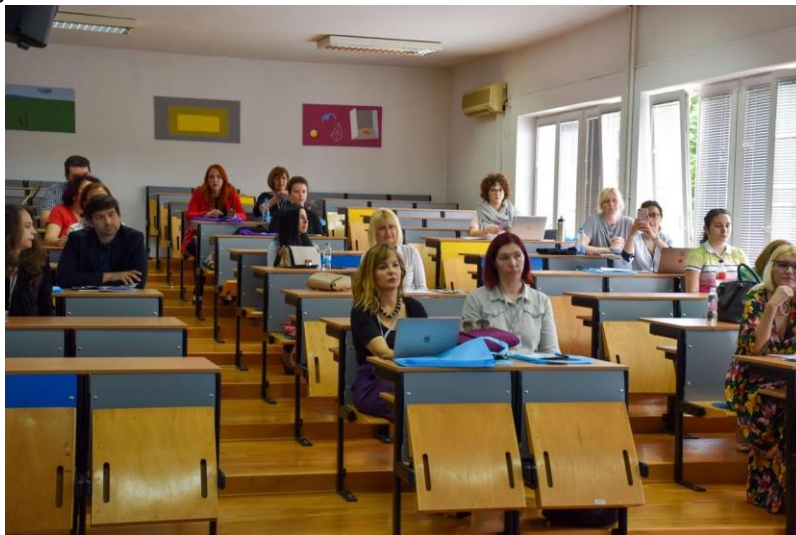
"Gender Equality at Universities: Theoretical Perspectives, Institutional Action and Social Engagement", Banja Luka, May 26-27, 2022

Representatives of the Helsinki Citizens' Assembly took part in the two-day regional conference "Gender Equality at Universities: Theoretical Perspectives, Institutional Action and Social Engagement", organized by the Institute for Humanities and Social Sciences of the Faculty of Philosophy on May 26 and 27. Representatives of universities, scientific institutes and non-governmental organizations from Serbia, Croatia, Montenegro and Bosnia and Herzegovina participated in the work of this scientific and professional meeting.