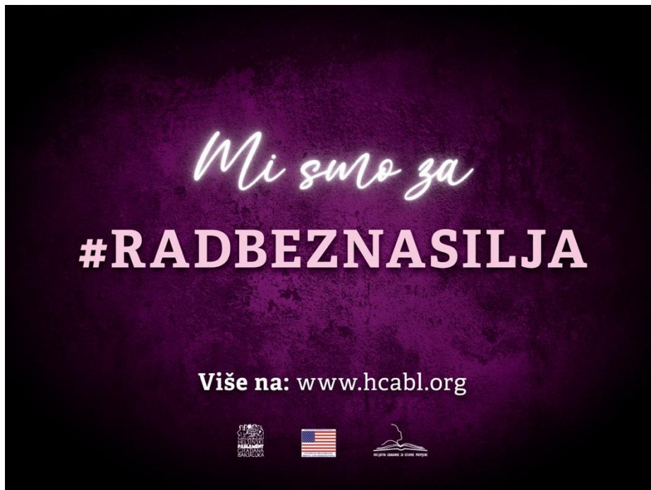
Billboard campaign for #radbeznasilja

Also, as part of the 16 Days of Activism against Gender-Based Violence, the #redbision campaign was implemented to raise the awareness of the workers on GBD as well as getting acquainted with legal aid providers they can turn to; and meetings were held to network relevant actors and free legal aid providers.