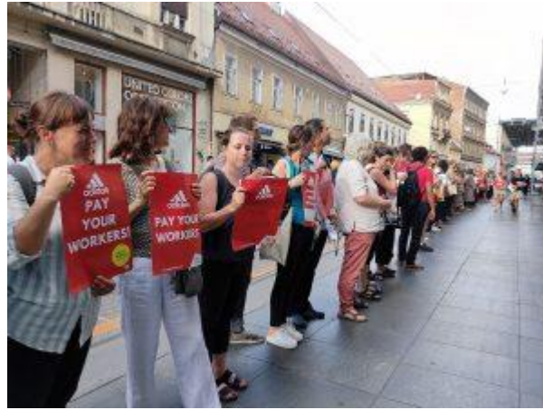
Protests in front of Adidas stores, July 2022, Zagreb

Also, the representatives of the Helsinki Citizens' Assembly Banja Luka participated in the Zagreb Forum 2022 - a global conference called Living Wage is Possible! which took place from 4 to 7 July 2022, which gathered more than a hundred participants from all over the world. Within this conference were held the protests in front of Adidas store in the center of Zagreb called ADIDAS PAY YOUR WORKERS, as well as the press conference called 'Support Workers Who Sew Your Clothes' and thus were supported the workers of the Orjava factory which OLYMP owes 450,000 euros severance pay. You can see more about these activities in the video: https://www.youtube.com/watch?v=ucgk-po8rng